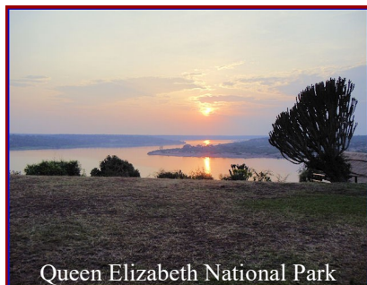
Queen Elizabeth National Park

The Country of Uganda is a breath-taking country filled with many natural resources.